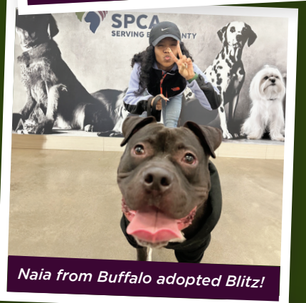
Naia from Buffalo adopted Blitz!