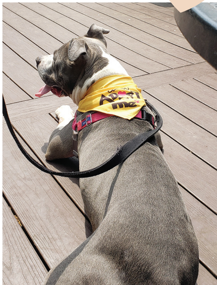
Herschel's Doggie Entourage included time at Hamburg Brewery!

Even if adoption is not on your mind, you may encounter someone during your outing who develops an instant affection for the dog you've taken out.